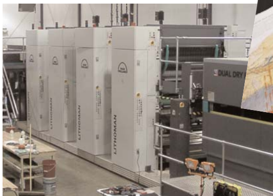
This view of the LITHOMAN IV installation, taken in late March, shows the new press in place and ready to run.

And after extensive site preparation, construction has just begun on a large addition to the plant. The new construction will add high-bay roll storage adjacent to the new press and will more than double the plant's paper storage capacity. The project is right on schedule for completion by the end of July. 📧