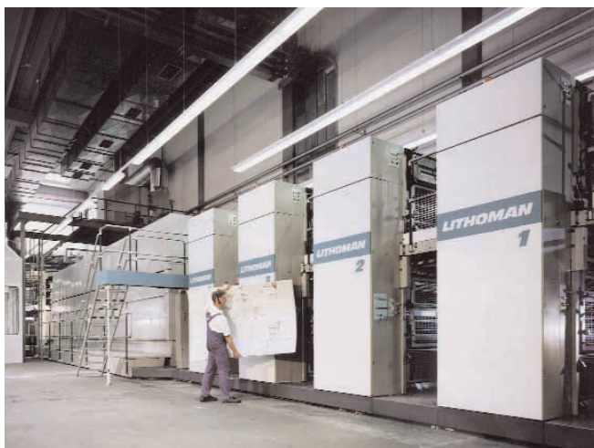
The state-of-the-art MAN Roland LITHOMAN IV press will be fully operational in April 2004—well ahead of the busy summer season.