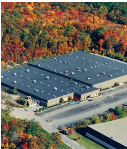
Courier Stoughton produces more than 29 million books per year from this 175,000 square foot facility.