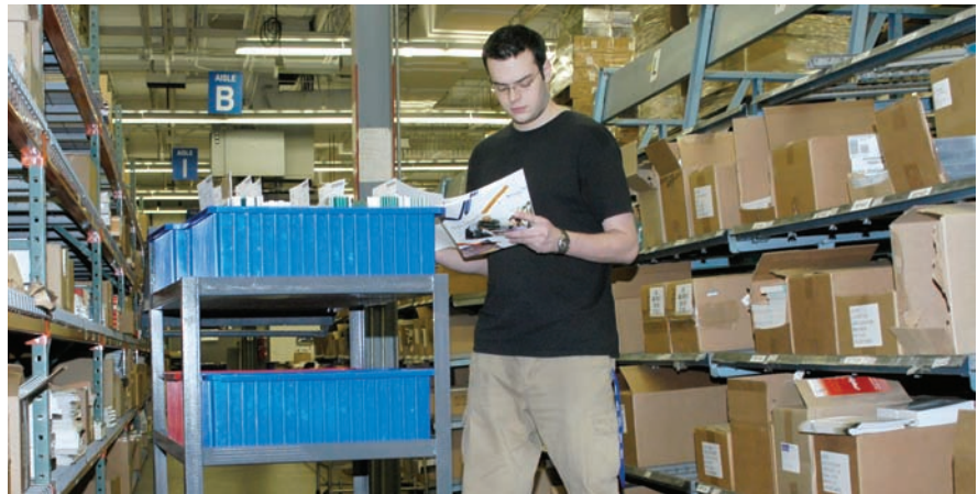
Your orders are all hand picked, packed and shipped from a dedicated 42,000 square foot warehouse in North Chelmsford, MA.