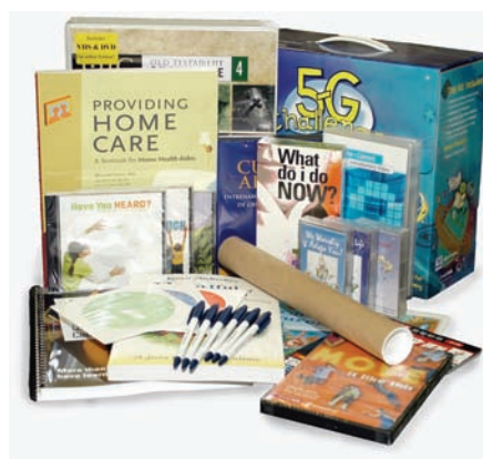
Courier Fulfillment handles a variety of products for book publishers.

Books may be paramount, but most publishers also need to ship a variety of products in addition to their books. Courier can help with this. CDs, DVDs, video and audiotapes, posters, sales kits, and promotional packages are just a few of the many items that Courier Fulfillment can assemble, store, and ship. In fact, almost half the products that we handle for book publishers are not books. Courier Fulfillment Services simplifies the complicated task of managing a broad range of different products. 📦